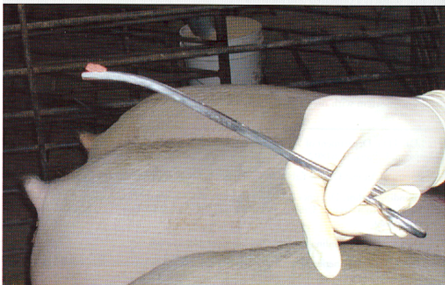
Figure 6: Tonsil biopsy specimen held in 310-mm Kocher forceps after harvest from an unanesthetized 110-kg pig.

After harvest, 112 of the 131 biopsy samples were placed directly in a 2-mL microcentrifuge tube containing 1 mL of RNAlater buffer (Ambion, Inc, Austin, Texas). The other 19 biopsy samples were first sectioned into two pieces with a new razor blade, so that each piece contained external and internal tissue. To recover both epidermal and lymphoid tissue in both sections, it was necessary to orient the sample so that the epithelial tissue could be visualized. The blade was placed perpendicular to the epithelial tissue and a slice made down the long axis of the sample. When samples were sectioned, one section was placed in RNAlater, and the other in a microcentrifuge tube containing 1 mL of neutral buffered formalin (NBF). Samples placed directly in RNAlater at the time of collection were