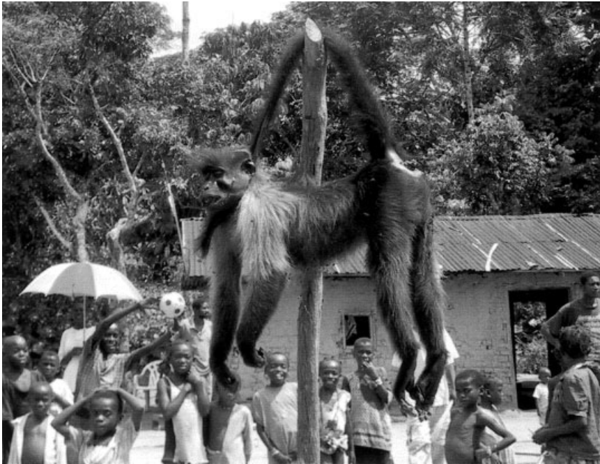
Figure 2. Hunted mangabey ( Lophocebus albigena ) for sale along a roadside in Cuvette West region of the Republic of Congo. Hunting and butchering of non-human primates is thought to have led to the origin of two significant emerging diseases with non-human primate zoonotic origins: AIDS and Ebola.

rubber tappers in a remote forest site of western Brazilian Amazonia killed more than 200 woolly monkeys ( Lagothrix lagotricha ), 100 spider monkeys ( Ateles paniscus ), and 80 howlers ( Alouatta seniculus ) over 18 months. The market for bushmeat is not restricted to tropical countries where these animals originate. For example, 25 tons of turtles are exported every week from Sumatra. 63 Individuals that hunt or butcher these animals risk contracting zoonotic infections.