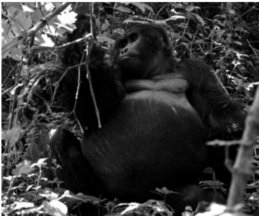
The silverback of the Mubare group