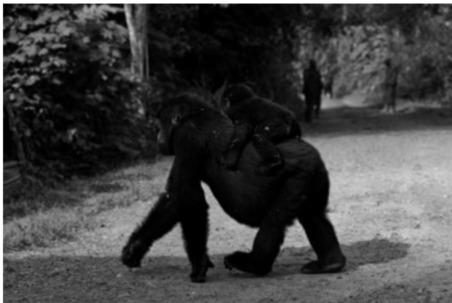
A member of the Rushegura group crosses a road in Buhoma – in front of human onlookers