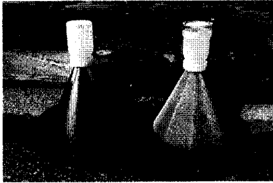
Fig. 1. Emergence traps next to a catch basin. The trap on the left is constructed of black plastic and the trap on the right is constructed of stainless steel mesh; all data presented in this study utilized the steel mesh trap style. The collection cup on the left is a closed inverted cup, while the cup on the right includes a removable lid with a screen mesh top.

order to estimate total Culex emergence from catch basins per unit area, we determined the density of catch basins in our study region at 11 residential sites and monitored them for the presence of immature Culex mosquitoes. Relative abundance of Culex mosquitoes was obtained using CO 2 -baited Centers for Disease Control and Prevention (CDC) miniature light traps.