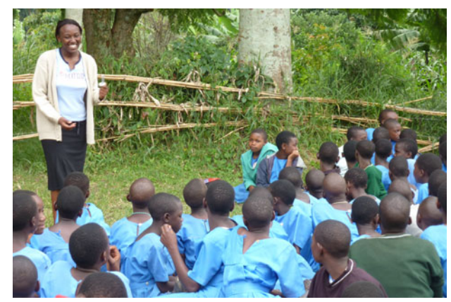
PLATE 2 The nurse from the Kibale Health and Conservation Centre giving an outreach talk at a local school.

A common criticism of conservation programmes that aid local communities and improve economic welfare is that they promote immigration and increase population growth near the protected area. For example, Struhsaker et al. (2005) estimated that 47% of tropical protected areas in Africa had